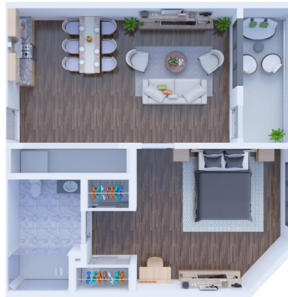
B6 One Bedroom 542 SQ FT