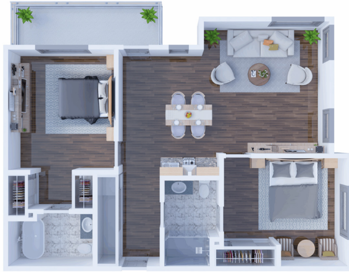
C1 Two Bedroom 975 SQ FT