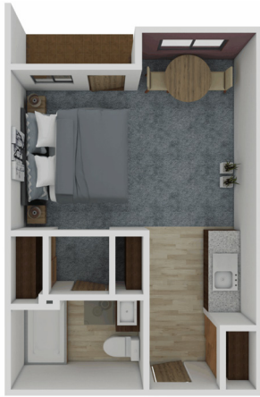
A1 Studio 404 SQ FT

Solstice at Sandy offers several floor plan choices to suit your needs.