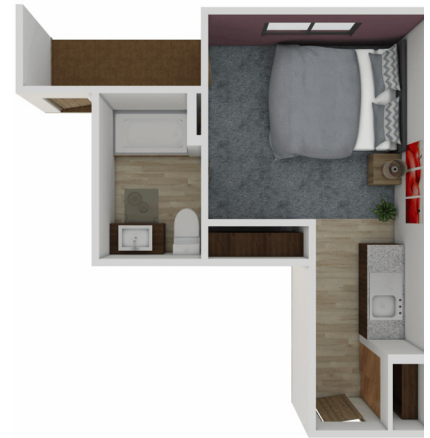
A7 Studio 335 SQ FT