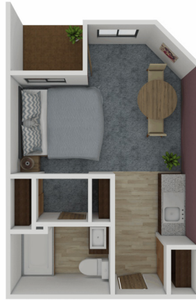
A5 Studio 388 SQ FT