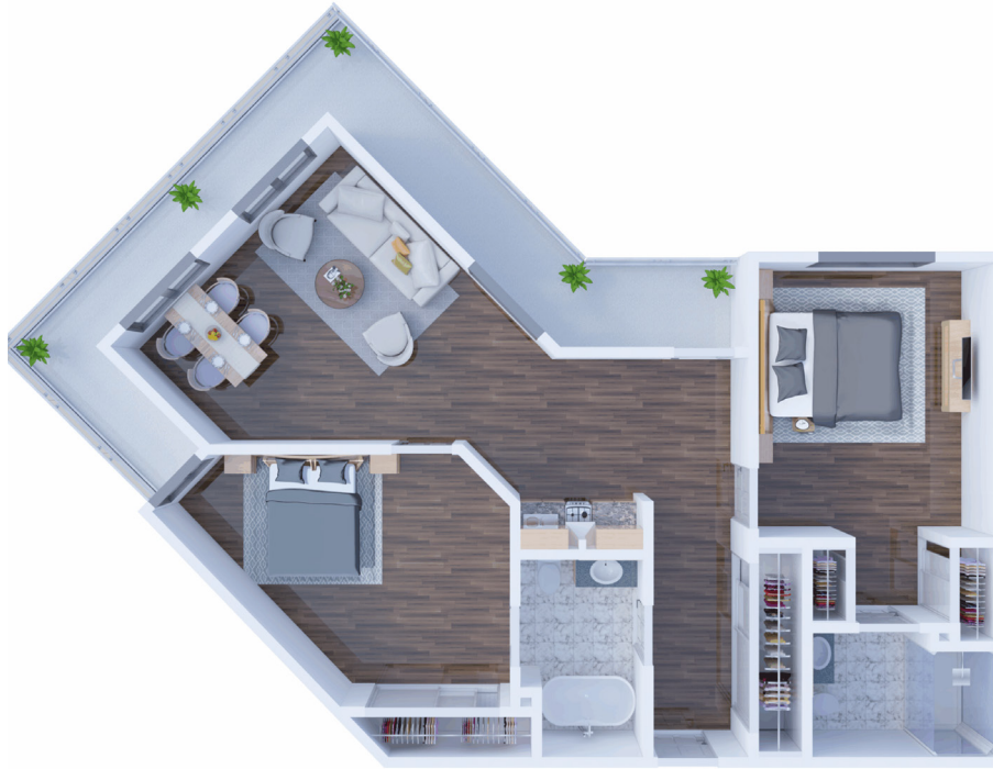
C4 Two Bedroom 971 SQ FT