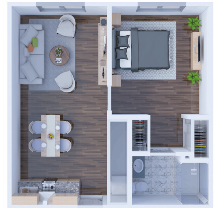
B13 One Bedroom 600 SQ FT

Solstice at Sandy 310 E 10600 S | Sandy, UT 84070 844.243.9161 SolsticeAtSandy.com