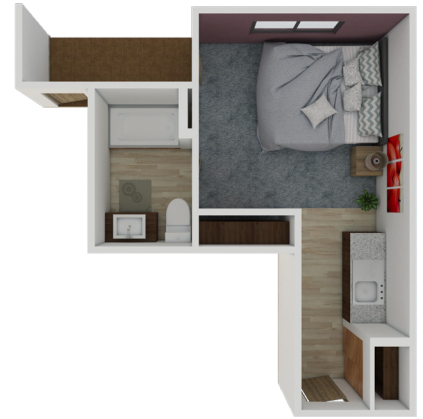
A7 Studio 335 SQ FT