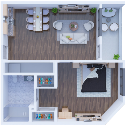
B5 One Bedroom 663 SQ FT