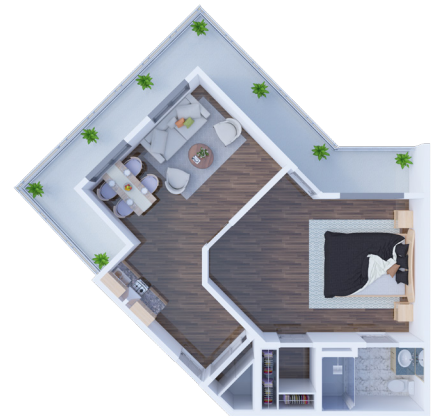
B13 One Bedroom 600 SQ FT

Solstice Senior Living at Sandy 310 E 10600 S, Sandy, UT 84070 (844) 243-9161 SolsticeSeniorLivingSandy.com