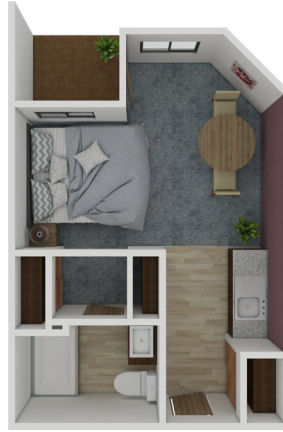
A5 Studio 388 SQ FT