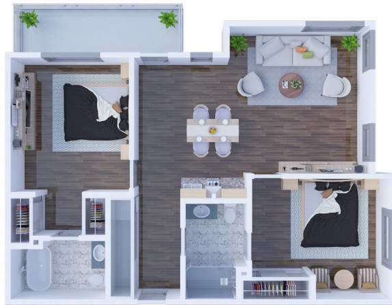
C1 Two Bedroom 975 SQ FT