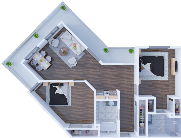
C4 Two Bedroom 971 SQ FT