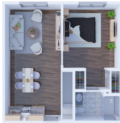
B6 One Bedroom 542 SQ FT