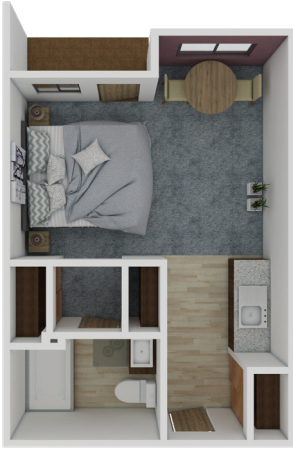
A1 Studio 404 SQ FT

Solstice Senior Living at Sandy offers several floor plan choices to suit your needs.